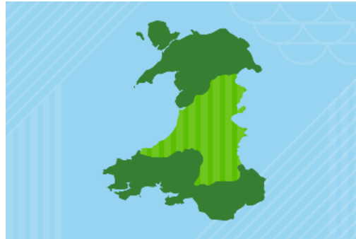
Jobs in Mid Wales