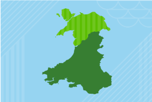
Jobs in North Wales

The Regional Future Jobs Wales contains LMI on 15 different industries in Wales.