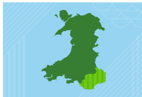
Jobs in South East Wales