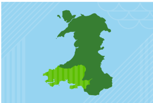
Jobs in South West Wales